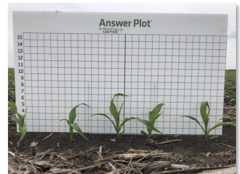
Consistent emergence and growth showcased by CP4757VT2P/RIB