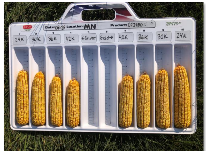
2021 treatment and population demo. Le Sueur, MN