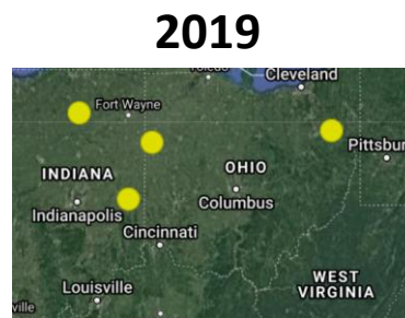
2019/2020 Answer Plot® trials: performance against mean, Eastern United States