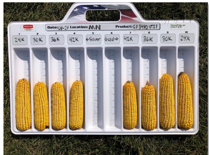
2021 Answer Plot® trial. Treatment and Population Demo. Le Sueur, MN